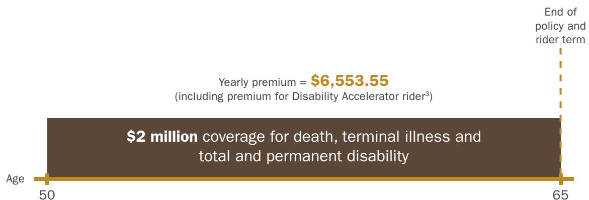
Diagram is not drawn to scale and the figures used are for illustrative purposes only.

ABC Company signs up for TermLife Solitaire to insure Mr Ong with a sum assured of $2 million. The company also adds a Disability Accelerator rider 3 with a sum assured of $2 million and chooses a policy and rider term of 15 years. The company decides to pay premiums on a yearly mode.