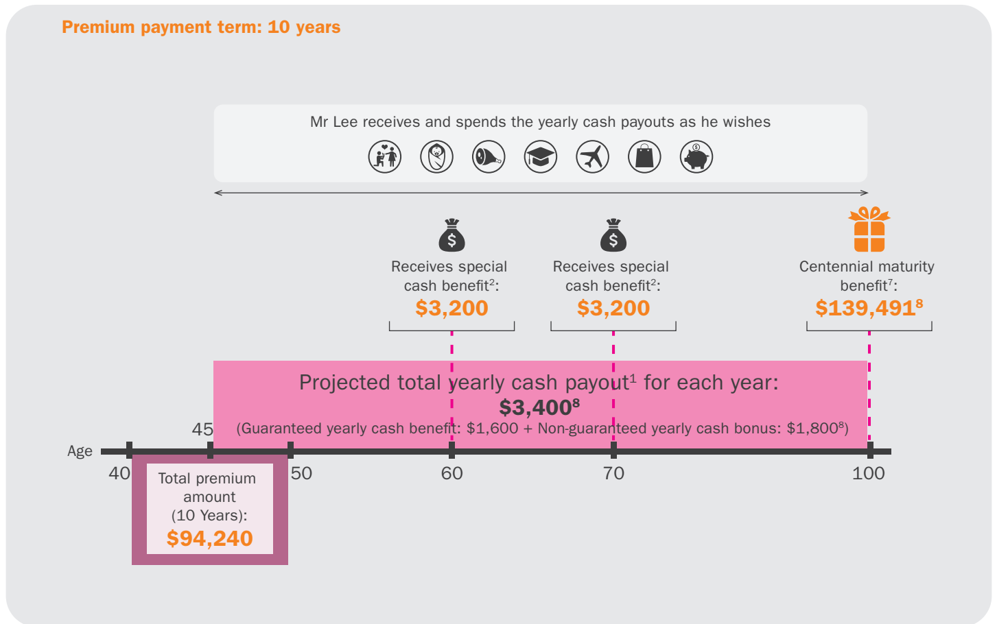
Diagram is not drawn to scale and the figures used are for illustrative purposes only.

From the end of the 5 th policy year onwards, the policy begins to pay out yearly cash payouts 1 of $3,400 8 . The policy also pays out a special cash benefit 2 of $3,200 at the end of the 20 th and 30 th policy year respectively. Mr Lee chooses to receive the yearly cash payouts 1 and special cash benefits 2 and spends them as he wishes.